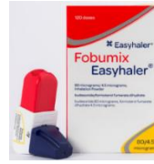
Fobumix inhaler is