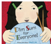
Dim Sum for Everyone