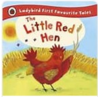
The Little Red Hen