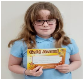
1 st child to achieve golden reading challenge award.